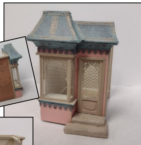
MT2 - 1/4" "Jewel Box" Shop & Furniture by Carl Bronsdon 1/4" Scale • $124