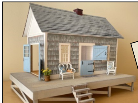
W3 - The Boathouse B&B by Carol Kubrican 1/4" Scale • $190