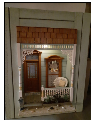
M2 - Seaside Sanctuary by Sue Ann Ketchum 1/2" Scale • $209