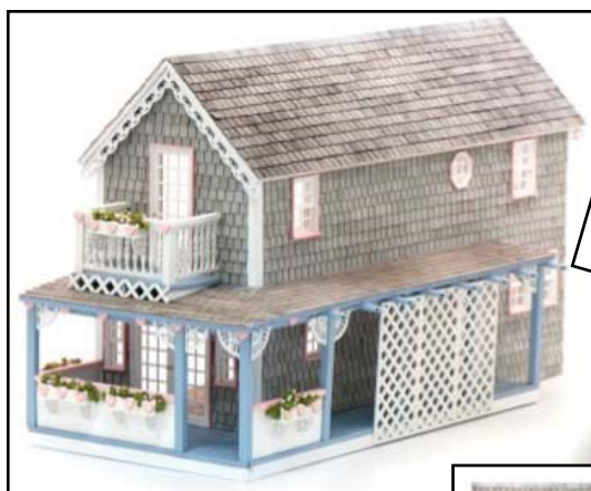
MT1 - Birdhouse Bluff by Ruth Stewart 1/4" Scale • $295

2-Day Workshop • Monday & Tuesday • 8:00 a.m. - 5:00 p.m.