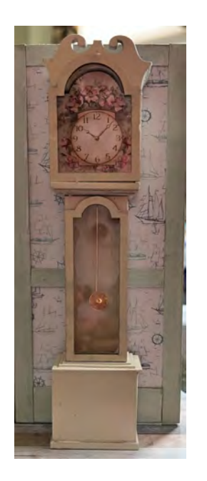
GRANDFATHER CLOCK Basswood and acrylic