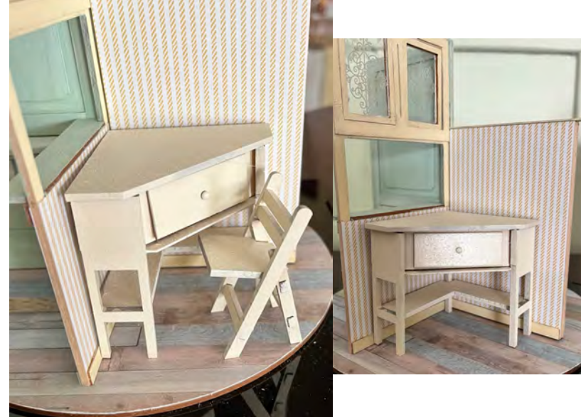
BOOKSHELF Basswood, 4 shelves