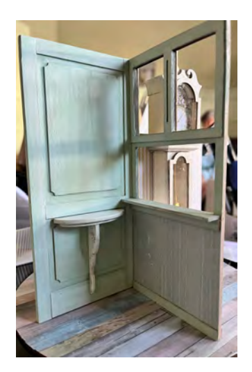
HALF TABLE Engraved on the side of the leg